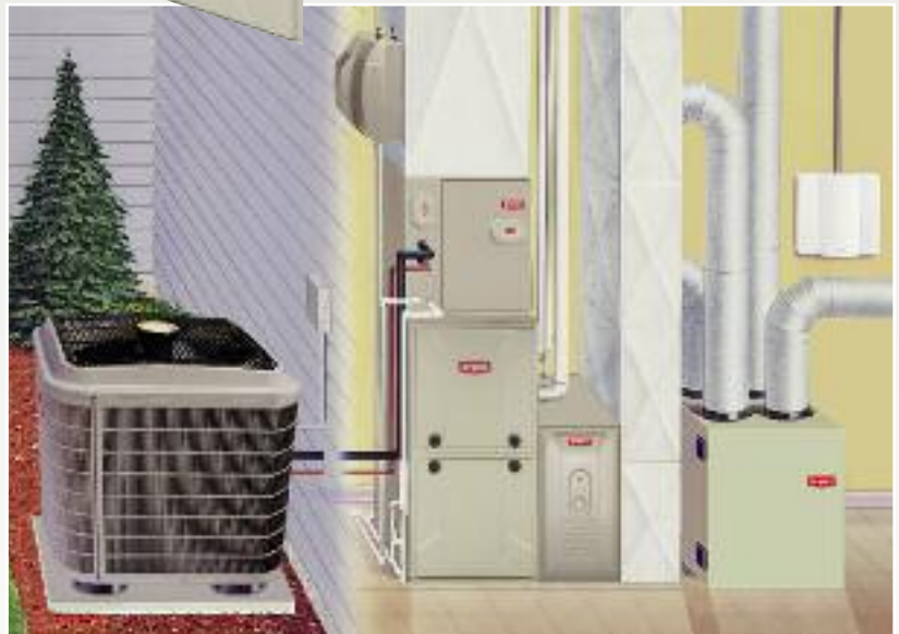
HYBRID HEAT® Dual Fuel Heat Pump and Gas Furnace System